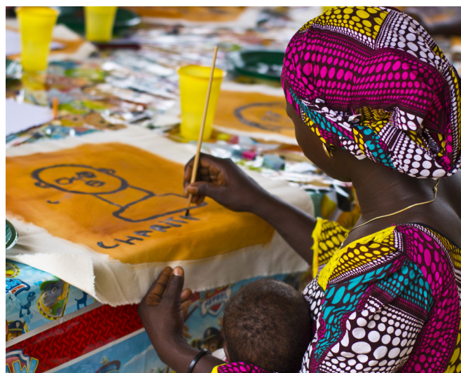
Charity was a participant of a trauma healing programme for survivors of sexual violence in 2018. She was held captive by Boko Haram for three years, as an 'infidel' and was forcibly married to a fighter. She became pregnant and gave birth to a baby girl.

In research into gender-specific violence, effort is being made not to hide gender-based violence behind the cloak of marriage. Thus, instead of counting violence as domestic, we are counting it as physical violence. Further analysis of the use of sexual violence and forced marriage are included below in "Investigating violence against women and girls."