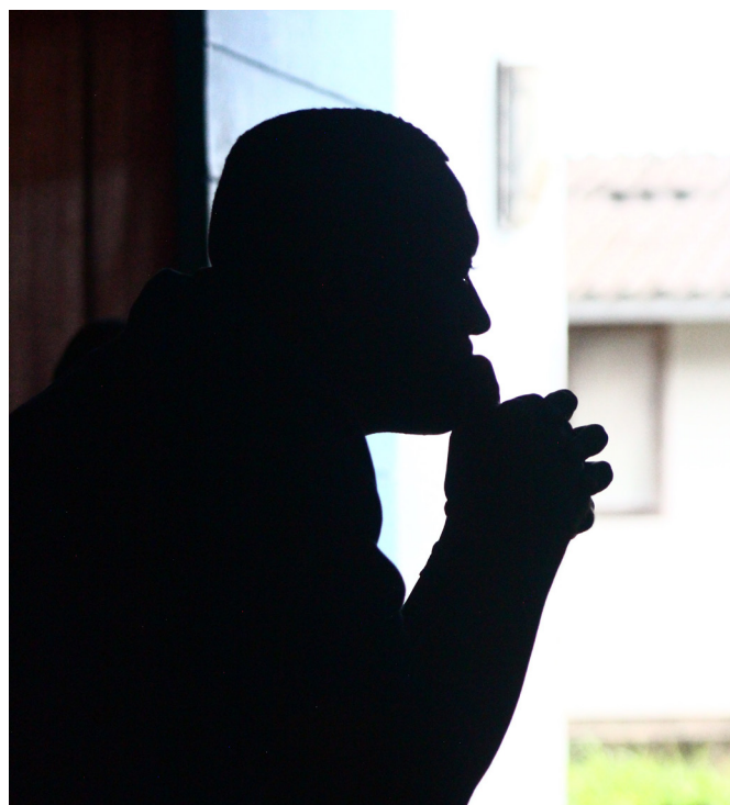
In the middle of violence and persecution the pastors of Buenaventura, Colombia, persist in preaching the gospel.

Long-term trauma care for victims can be the key element to help survivors deal with their paralyzing sense of helplessness. In addition, faith communities have the opportunity to reexamine the non-verbal message they send to their survivors of persecution. There are many responses to persecution events that inadvertently reinforce the value judgments of perpetrators and ensure the impunity with which they can act. This may be through reinforcing societal stigma for events over which a victim had no agency, or choosing to respond differently to men and women who have suffered.